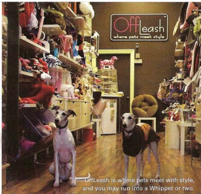
OffLeash is where pets meet with style, and you may run into a Whippet or two.